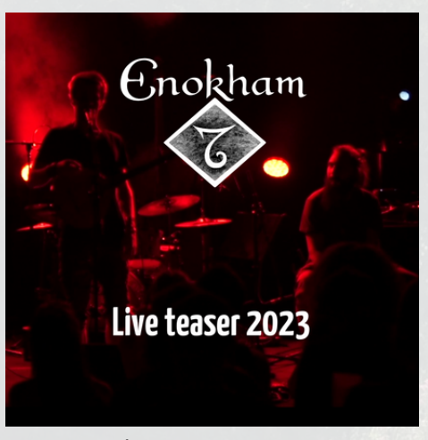
<u>Live teaser 2023</u> (01/09/23)