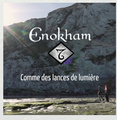
Comme des lances de lumière <u>Clip (30/09/22)</u>

"Sentier, où se couler dans les pierres. Apaisé Gaieté, nourrie d'un profond mystère. Éveillé." Pèlerinage - Last single