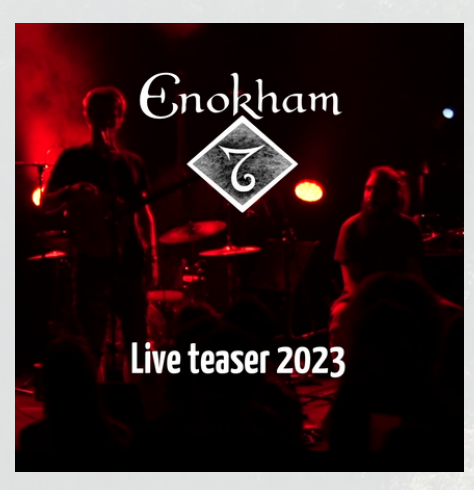
<u>Live teaser 2023</u> (01/09/23)