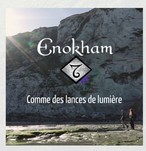
Comme des lances de lumière Clip (30/09/22)