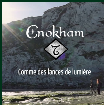
Comme des lances de lumière Clip officiel (30/09/22)