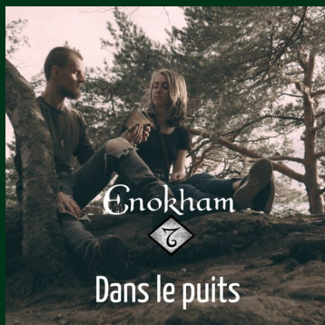
Dans le puits Clip officiel (18/09/20)