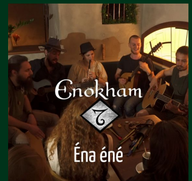
Éna éné Clip officiel (15/10/22)